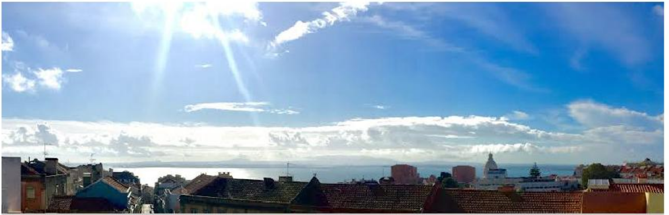
3 Bedroom Duplex with terrace and river view