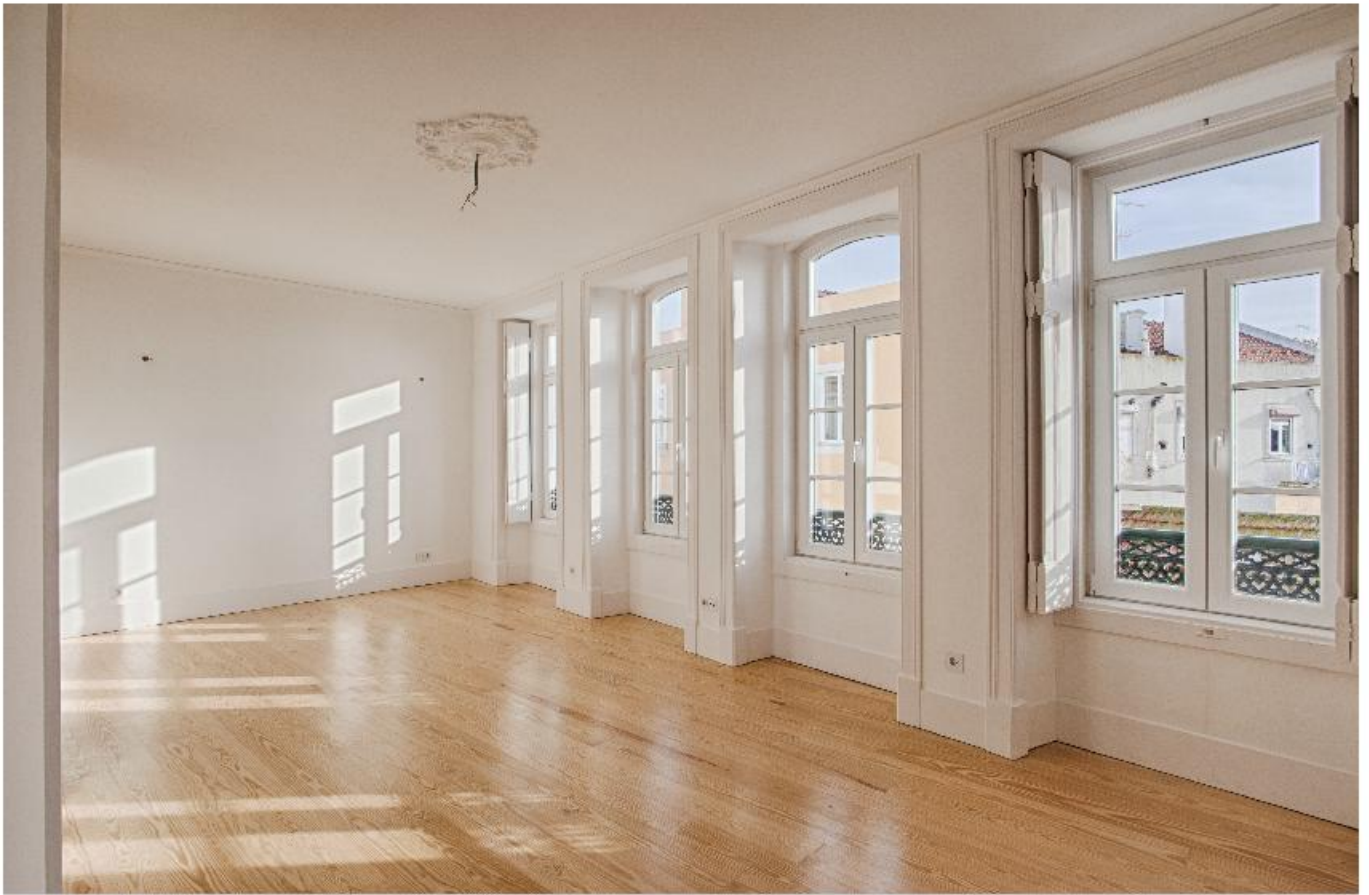
3 Bedroom Duplex with terrace and river view